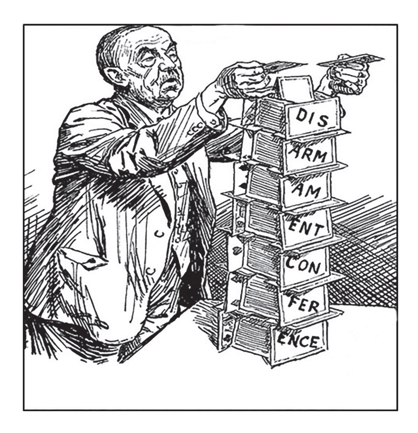
A cartoon showing the Prime Minister of France, published on the front cover of a British magazine, July 1934.

Answer both parts of the question with reference to the sources.