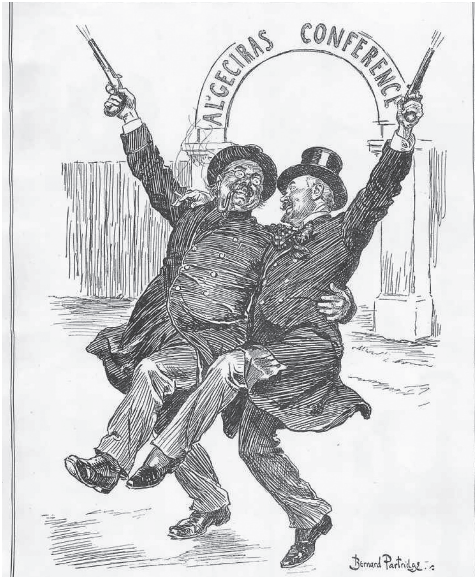
A British cartoon entitled 'Shots of Joy', published in April 1906. The caption to the cartoon read 'The Algeciras Conference has practically been concluded to the mutual satisfaction of the two rival powers whose differences at one time threatened to end in something worse than a diplomatic duel.'