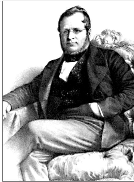
A painting of Cavour.