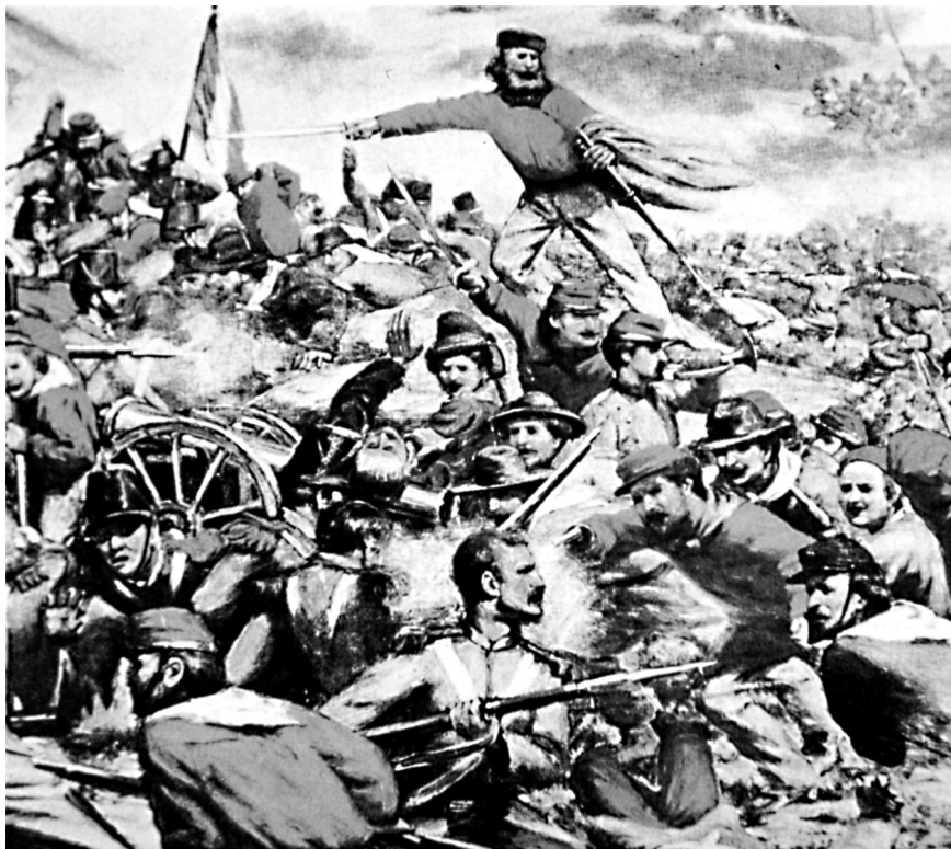
A drawing of Garibaldi at the Battle of Calatafimi in 1860 during the conquest of Sicily.