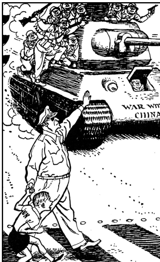
A cartoon from a British newspaper, November 1950. It shows General MacArthur ordering a South Korean tank to stop.