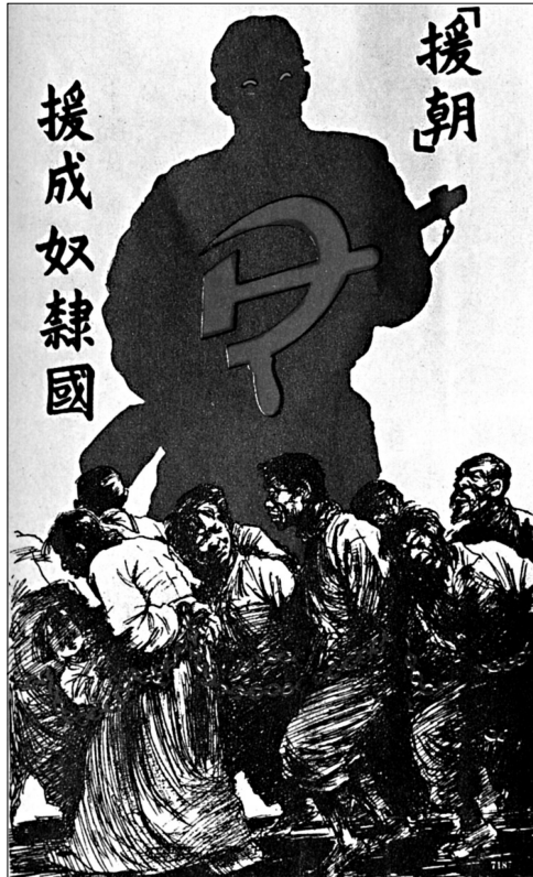
A South Korean poster from 1950 showing what the South Koreans feared would happen to their country.