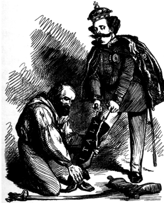
RIGHT LEG IN THE BOOT AT LAST.

“IF IT WON’T GO ON, SIRE, TRY A LITTLE MORE POWDER.”